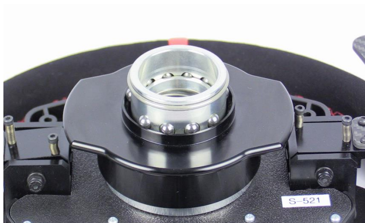
Quick Release Back of Wheel