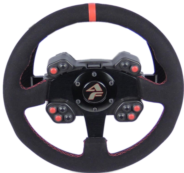
Wheel and Button Box