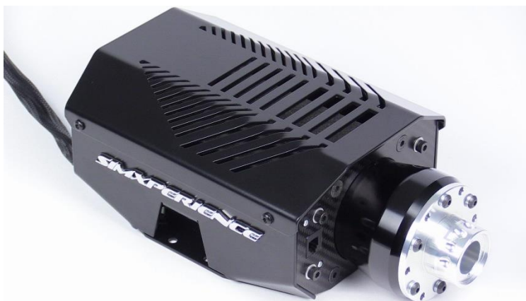
Main Enclosure Base